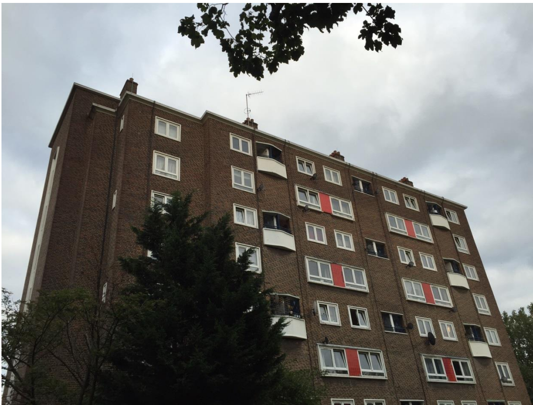
Image 2: Closer view of the building from Elizabeth Street (Southwest elevation)