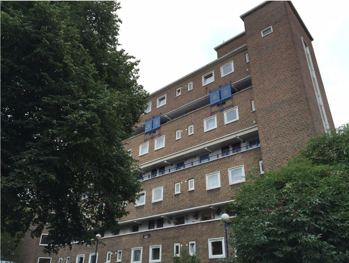
Image 3: Northeast (rear) elevation of the building from Elizabeth Street