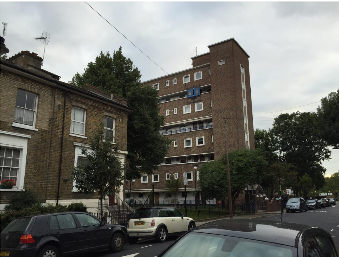
Image 4: Long view from junction of Halliford Street and Elizabeth Street