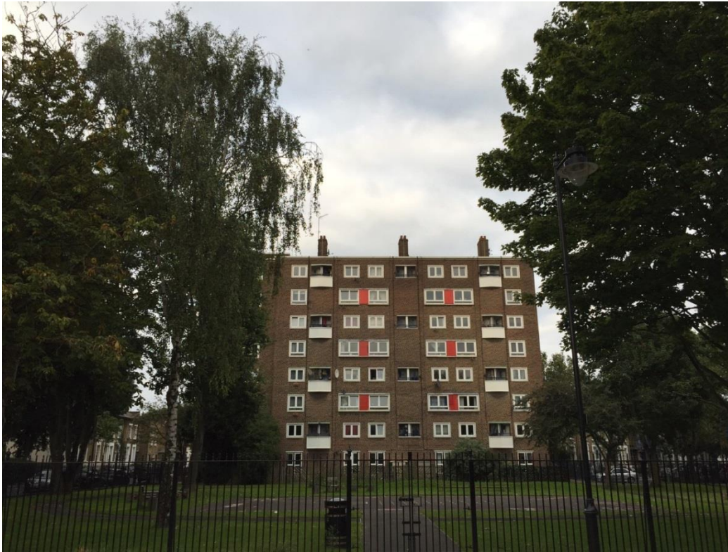
Image 1: View of the building from Rotherfield Street (Southwest elevation)