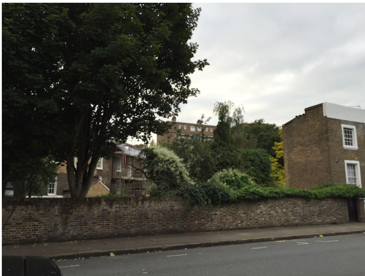
Image 5 : Further view of the rear elevation from Halliford Street